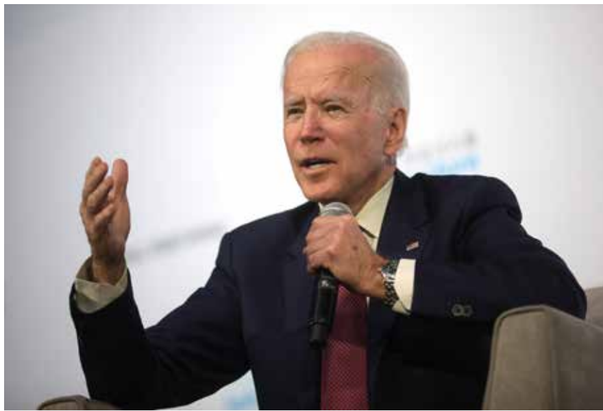
Wikimedia Commons Gage Skidmore

Truth be told, the Democrats have no choice but to run on the abortion issue because it's all they've got . What else could they possibly run on?