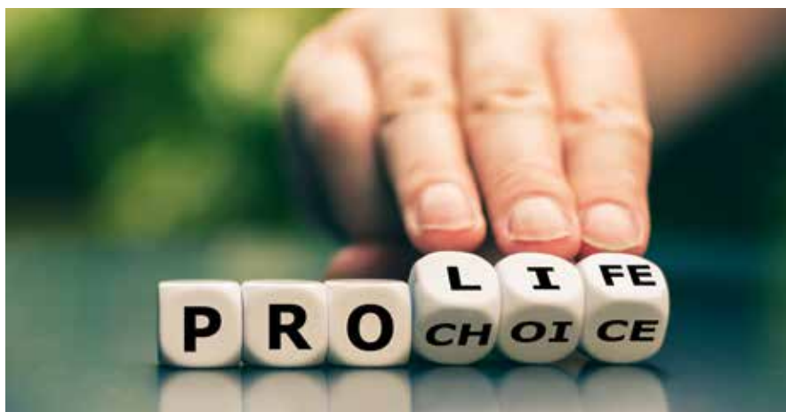
Getty images / Fokusiart