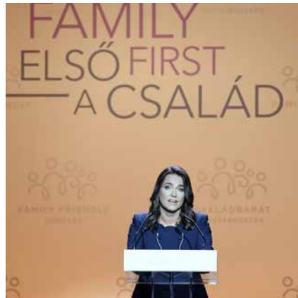
Hungary's President Katalin Novák at the Budapest Demographic Summit