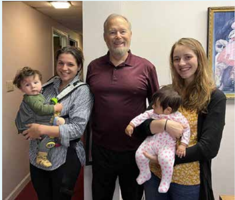
Here at PRI, we practice what we preach. The latest ‘new additions’ to the PRI staff.