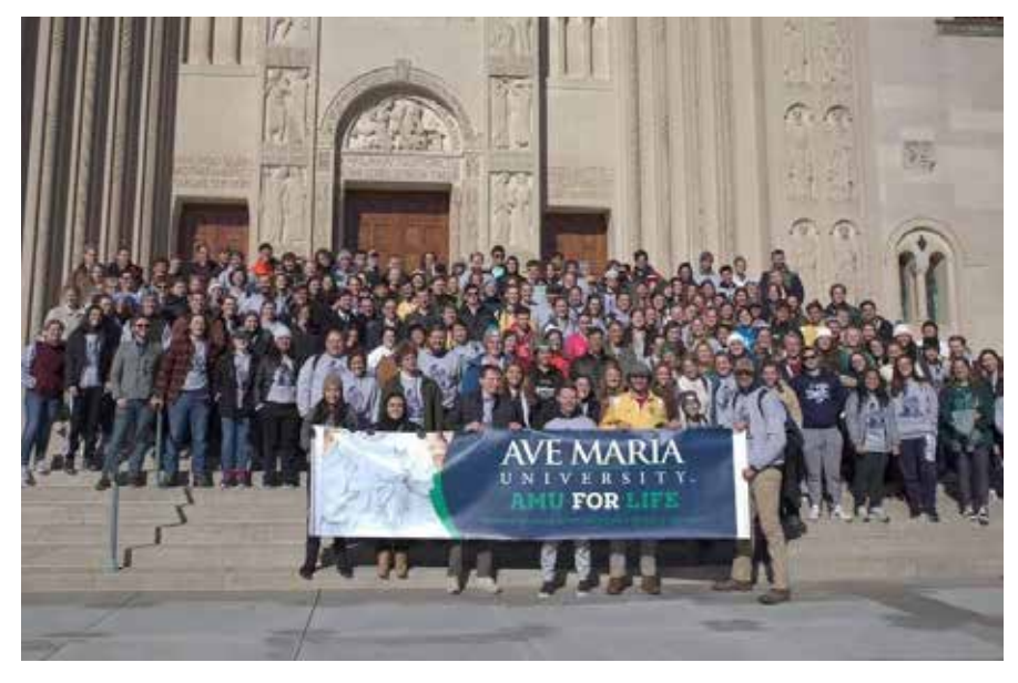
Ave Maria students at the 49th annual March for Life.

We were joyfully received and hosted by St. John the Beloved Parish and school in Arlington, Virginia. The men slept on the gym floor and the women in the cafeteria. Although the floors were hard and the bathrooms limited, it didn't matter. This was a pilgrimage, not a vacation trip, and pilgrims don't expect first-class accommodations. The commu-