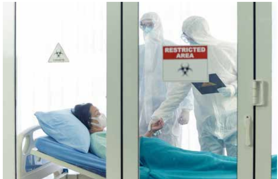
Doctor examines Covid-19 virus patient in restricted room

"The killer coronavirus probably originated from a laboratory in Wuhan," they write.