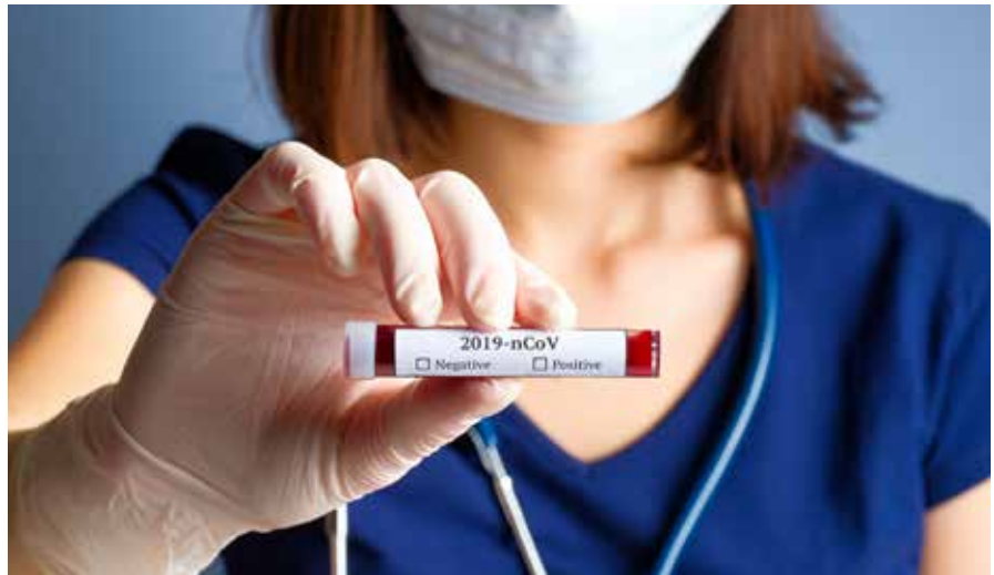
Nurse holding test tube with blood for 2019-nCoV analysis

Understand that everyone who dies in China is cremated. Not long after the Communists took power in 1949, the traditional practice of burying the dead in coffins was outlawed on the grounds that it took land away from farming. This means that we can assume that the number of cremations equals the number of deaths.