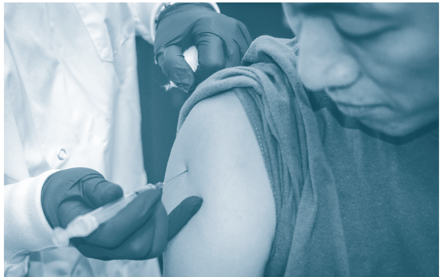
Chinese person receiving vaccine

Their orders are to arrest anyone found to be carrying the disease and put them into containment centers. 2 They are authorized to use force against anyone who resists, and Xi