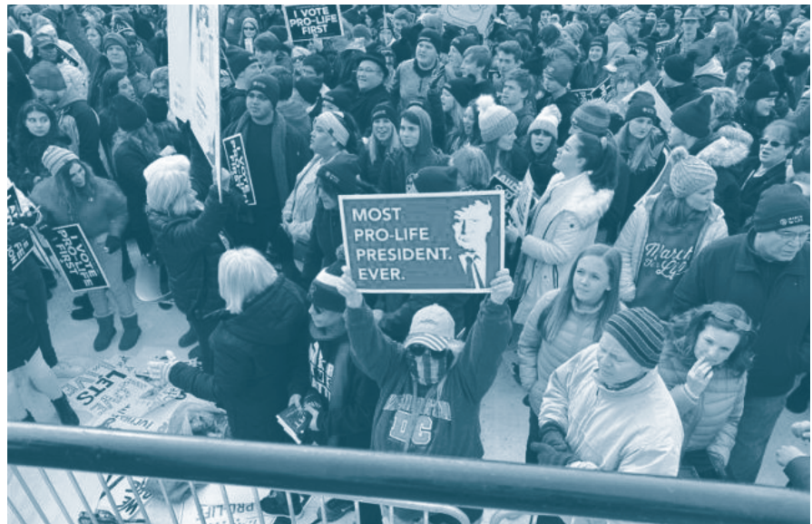
March for Life 2020 attendee holds pro-Trump sign

The battle lines have been drawn. On the one side are the majority of Americans. On the other looms the collective might of Manhattan and Hollywood, of the mainstream media and the Washington swamp,