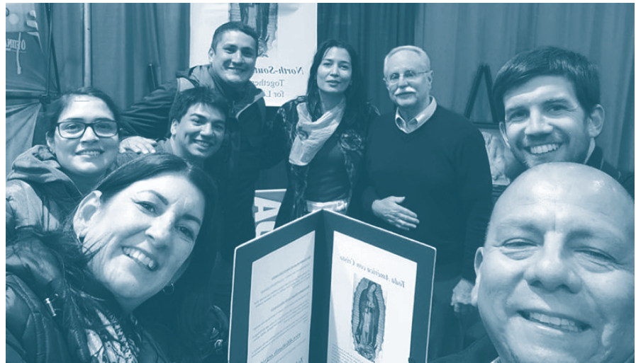
PRI Latin American Staff in Washington, D.C., for the historic March for Life at which President Trump spoke

On the pro-abortion side, the view is certainly unanimous. There is not one promoter of abortion in the world that doubts for even a second that Trump is the worst enemy for their cause, that he has done more to damage the pro-abortion agenda than anyone else, and that Trump has few qualms about openly challenging the pro-abortion agenda without fear of the political consequences.