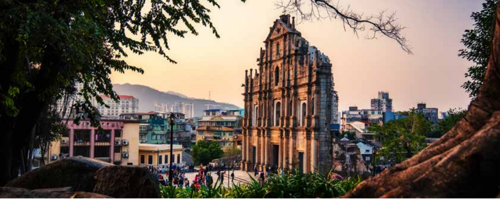
Ruins of St. Paul's church in Macau, China