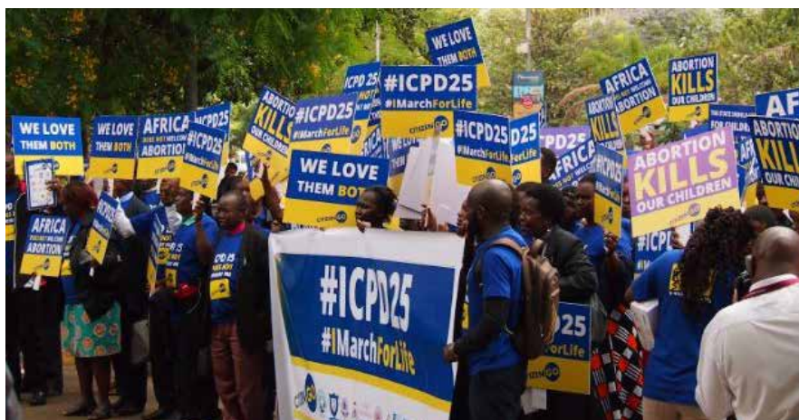
Kenyan citizens gather in downtown Nairobi to deliver a petition with 87,000 signatures protesting the U.N. Nairobi Summit on ICPD25 (Jonathan Abbamonte/PRI).

Backed by a handful of wealthy European and Western nations, philanthropists and corporations, a small cabal of well-funded activists operating through the United Nations system is pushing for a narrow set of progressive views that are anathema to the cultural and religious values held by most of the developing world.