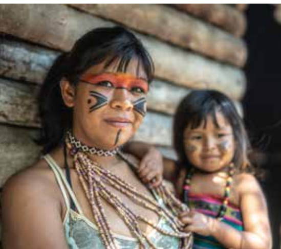
Indigenous Brazilian Woman and Child