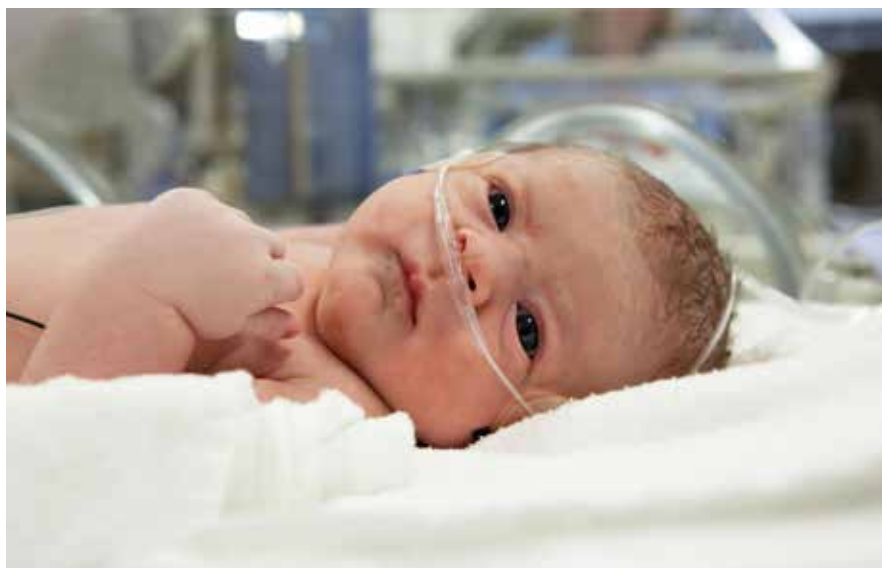
A newborn baby with breathing tubes in her incubator in NICU

The bill would also require health care workers to report to state or federal authorities any cases where infants born alive were not provided the necessary care.