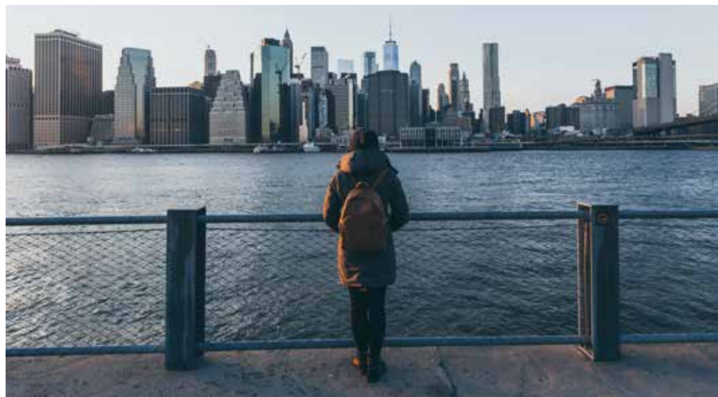
Young Female Standing in Front of Manhattan

First introduced in the state legislature back in 2006, the RHA met opposition from both moderate Democrat lawmakers and Senate Republicans who had held a majority in the state Senate since 2010. But after Demo-