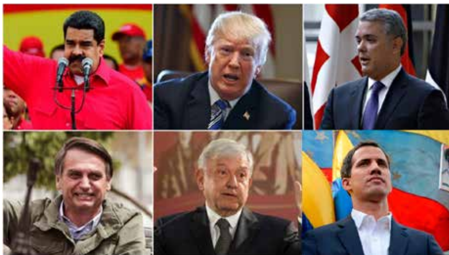
Top left to bottom left, clockwise: Nicolás Maduro (former President of Venezuela); Donald Trump (President of the United States); Ivan Duque (President of Colombia); Juan Guaidó (Venezuelan opposition leader); Andrés Manuel López Obrador (President of Mexico); Jair Bolsonaro (President of Brazil).

Can the regime of Nicolás Maduro and the Socialism of the 21st century be defeated? We do not know, but what we do know is that international forces are now tied together. Those who seek freedom and prosperity in this country are not alone. Through-