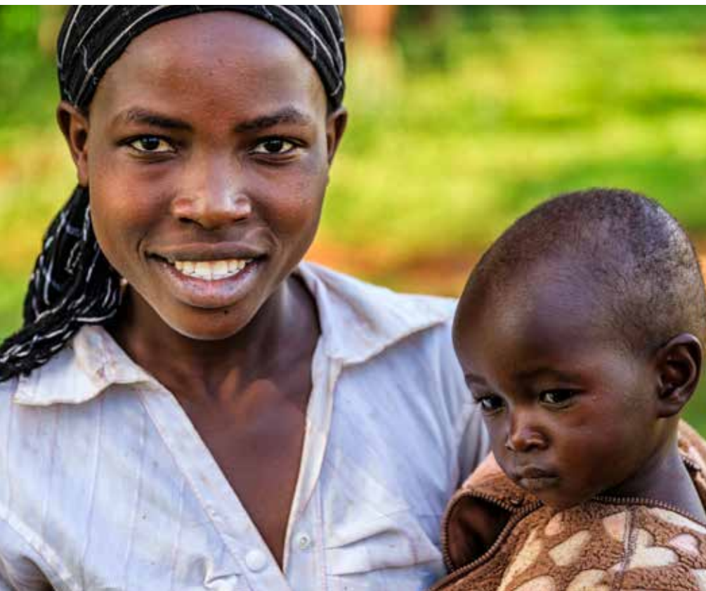
Young African woman holding her baby, Kenya, East Africa

The Kenya Film Classification Board is a state corporation responsible for rating and regulating TV, radio, and film content. The KFCB sets age restrictions on media content and enforces regulations on TV and radio content. Kenyan government regulations require that TV and radio content aired between 5 am and 10 p.m. “must be suitable for family listening and viewing.” 4 All programs and ads for TV and radio