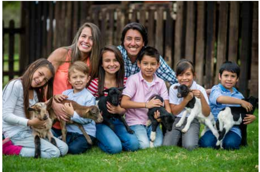
Large family at an animal park

Many families in the continent are limited in this regard because poverty is widespread. But the focus in school and in society is entirely on material needs. At school they began to teach us that the best way to achieve prosperity was to have only