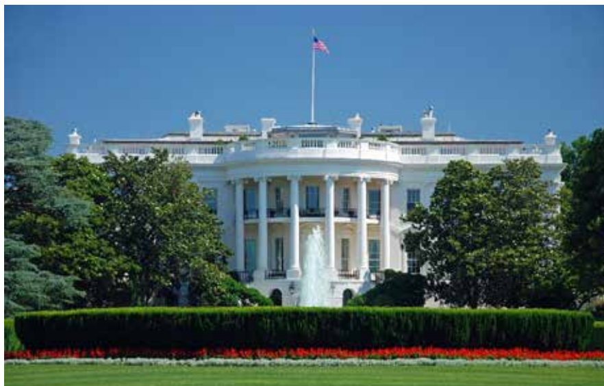
The White House in Washington DC

In addition, another rule released by HHS would undo a federal regulation that currently allows health insurance companies to collect premiums for abortion coverage and health care coverage together on the same