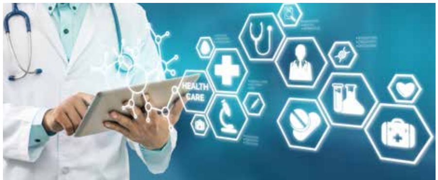
Doctor with Medical Healthcare Icon Interface

The rules would exempt religious organizations such as the Little Sis-