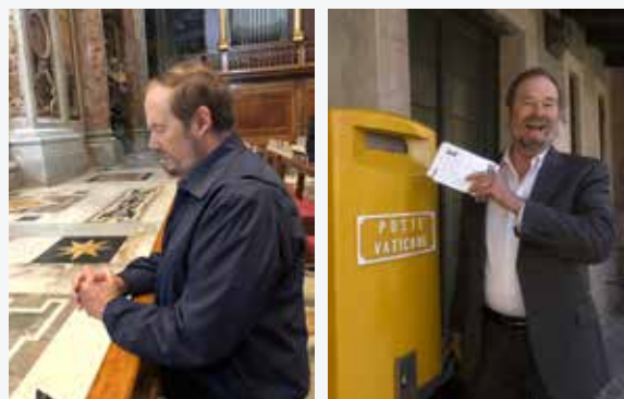
After praying for PRI's supporters at Mass in St. Peter's... ...we mailed them postcards.