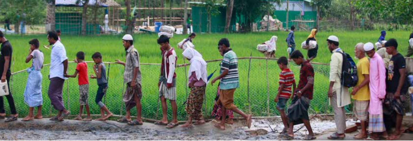
Rohingya Muslims, who crossed over from Myanmar into Bangladesh, walk through muddy field after collecting aid from a distribution center near Balukhali refugee camp, Bangladesh, October 2, 2017.