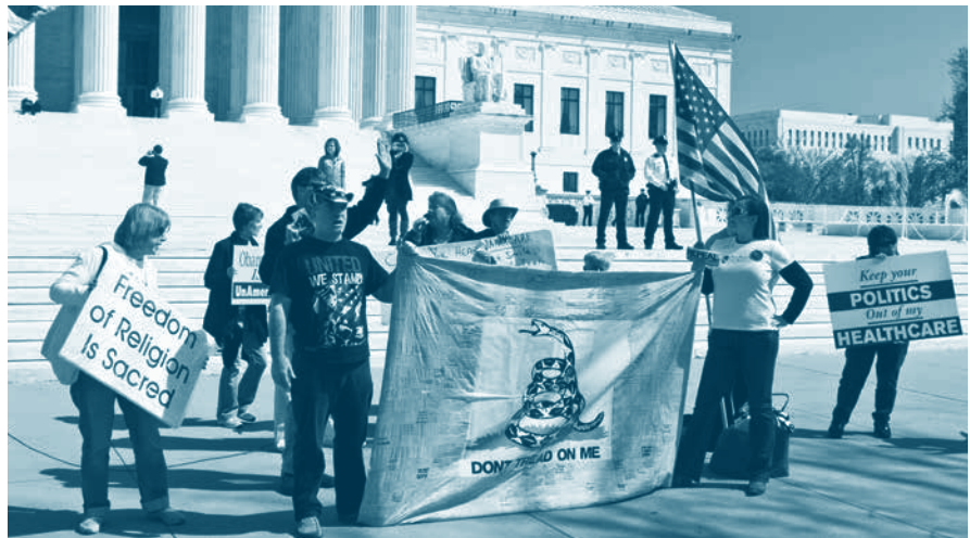
Activists protest Obamacare outside U.S. Supreme Court, Washington

"Any rule that allows employers to deny contraceptive coverage to their employees is an attempt at allowing