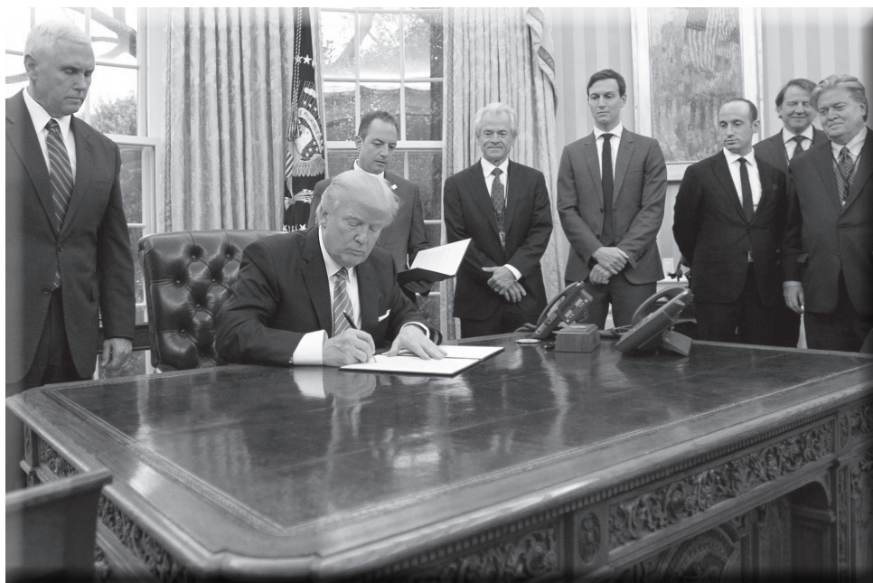
Donald J. Trump

U.S. Senate Foreign Relations Committee Chairman Bob Corker received a letter from the State Department on Monday stating that it had been determined that UNFPA was supporting the management of a family planning program involved with coercive abortion or involuntary sterilization and that, per a provision