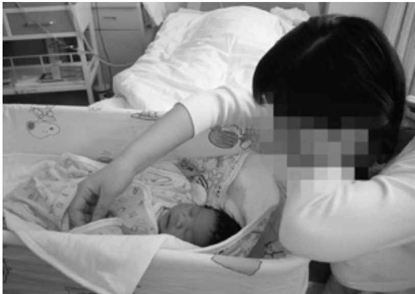
This child was preserved because of the Safe House program.

We at the Population Research Institute are proud to serve the cause of Life in a wide variety of fields: in academe, in politics, and overseas. But I think that we are most proud of our efforts to protect families in our China Safe House Program. And we are only able to do this work because of your support.