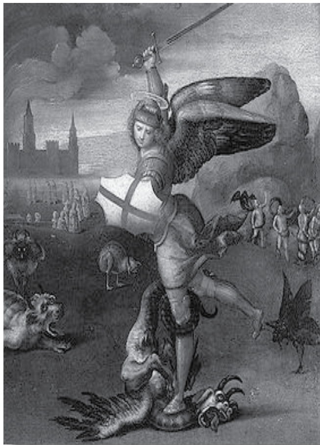
Image of St. Michael by Raphael.

Manual for Spiritual Warfare is essential for every devout Catholic who's also a sinner – and that's every single one of us! May I send you Manual for Spiritual Warfare today, to thank you for your much-needed gift of $50 or more?