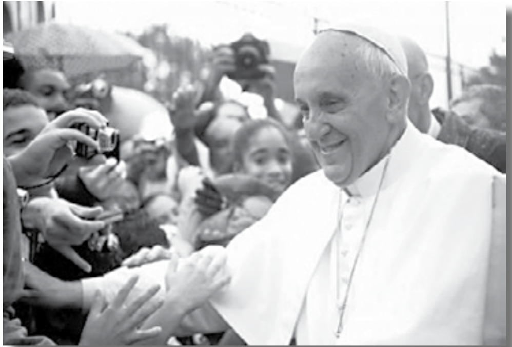
Pope Francis greets pilgrims in St. Peter's Square.

I, for one, am looking forward to the Holy Father's contribution to the debate on man and the environment. Here are some points I hope he'll present: