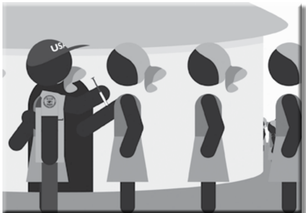
USAID ships millions of doses of Depo-Provera to African women every year.

This is, of course, a very serious charge, but we back it up in a shocking new video. The video, called “Depo’s Deception: New Dangers for African Women,” reveals that injectable contraceptives like Depo-Provera® increase the risk of contracting HIV.