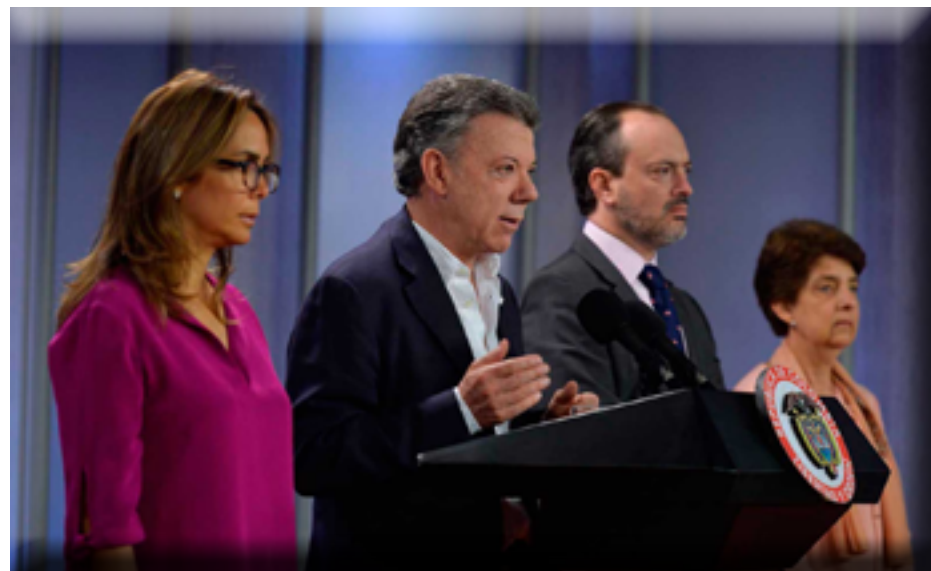
President Santos addresses opposition to "gender ideology" in school curricula.

In addition to the pressure from the public at large, the Catholic Church