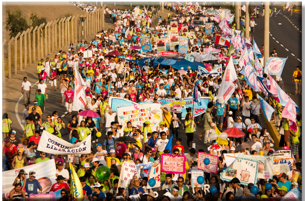
Peruvians take to the streets to defend the right to life.

The crowd was a cross-section of Peruvian society, with the young and the old, men and women, priests and laity, all well represented. With simultaneous marches taking place in other major cities, the total numbers of marchers nationwide was well over a million. Indeed, it is safe to say that this year's March was the largest public demonstration of any kind in Peruvian history. It will surely rank as