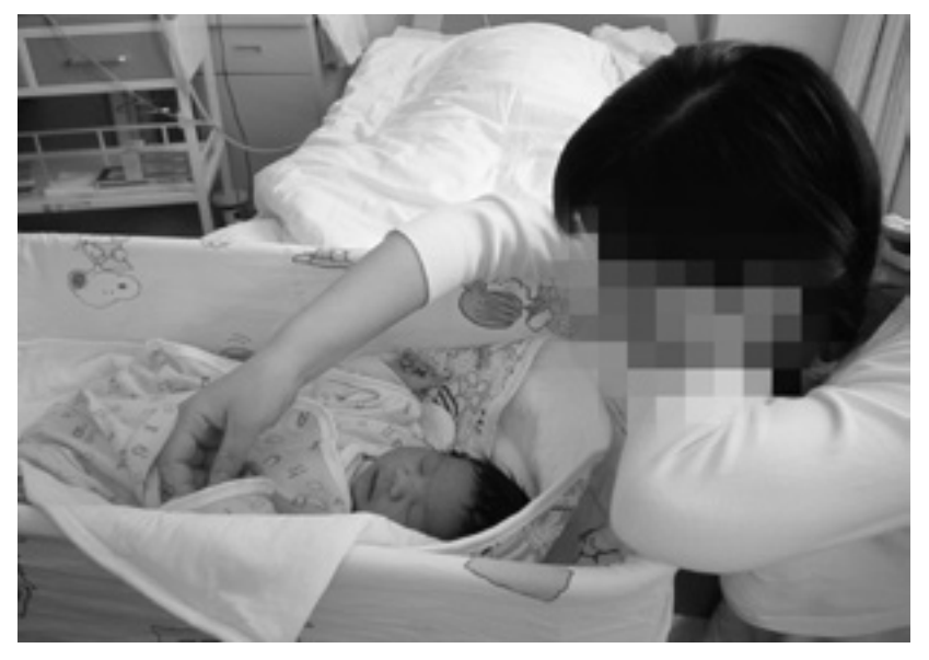
This child was preserved because of the Safe House program.

tightened restrictions at the hospitals, which make it difficult for those who do not hold an urban residence permit to be admitted. With the help of local Catholics, however, we have been able to work around this problem as well.