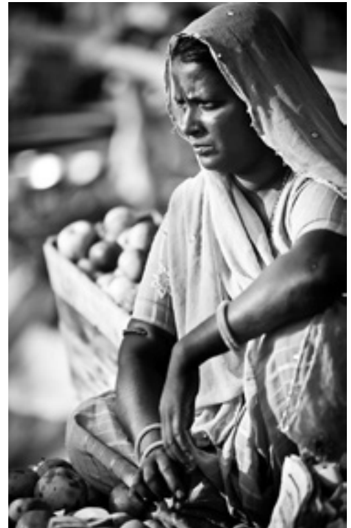
The effects of India's sterilization campaign are still being felt today.

Between June 25, 1975 and March 1977, an estimated 11 million men and women were sterilized using such tactics.